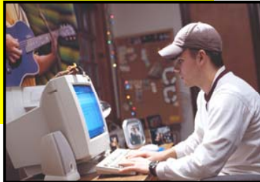
Virtual on-line classroom