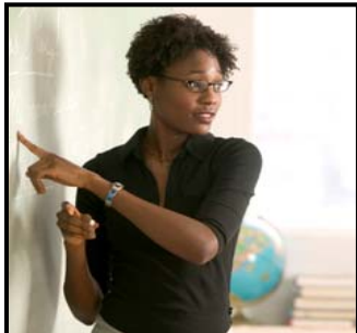
Public School or private Classroom instruction