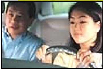
Behind the wheel instruction by professional or parent